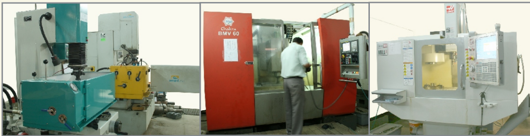
Mould Making Machines